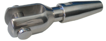
Metric Wire - 3mm to 26mm