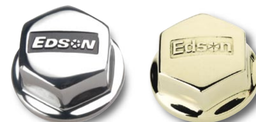
Stainless Wheel Nut #673ST