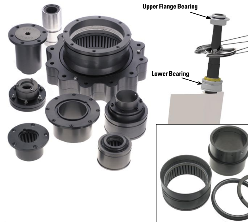
Upper Flanged Bearing

Edson Bearings are built to last with 3-times more Hard-coat Anodizing as found on other bearings.