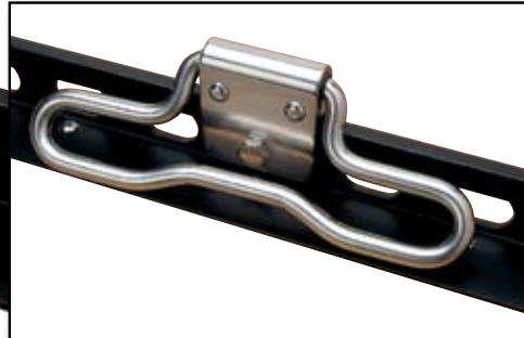
Toe Rail Folding Cleat