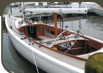
Custom Carbon Boom - Nantucket Splinter