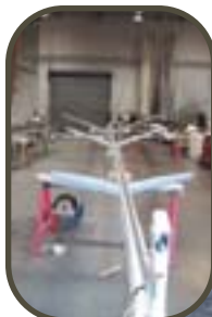
Schock 40 Carbon Mast