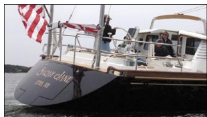
Fontaine 65 SARAH JANE