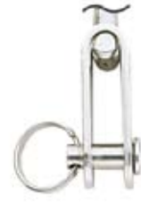
"T" Toggle Style