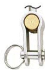
Toggle Nut Style